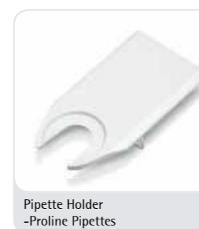
Pipette Holder -Proline Pipettes