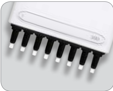
Safe-Cone Filters protect the pipette from contamination.

The exchangeable Safe-Cone Filters, used in pipette tip cones, act as barriers to prevent sample aerosols and fluids from contaminating the internal components of the pipette.