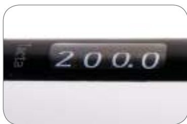
The volume is easy to read even when the pipette is angled.

The large, easy-to-read display helps you to see all four digits of the set volume from a distance without straining your eyes. The volume is easy to read even when the pipette is angled – eliminating the need to turn your head into an uncomfortable position.